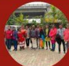
SWAN (Stranded Workers Action Network) Initiated in Jharkhand and covering South Delhi-Haryana, North, West and East Zones