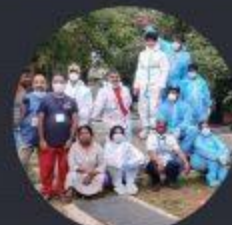
Covid warriors Bangalore based Citizens' Group