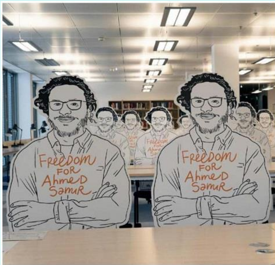
(Cover picture of the report by The Global Observatory on Academic Freedom)