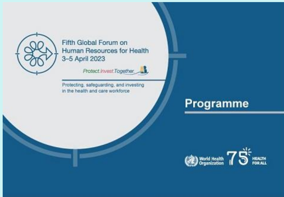
The Fifth Global Forum on Human Resources for Health | World Health Organization | April 3-5, 2023