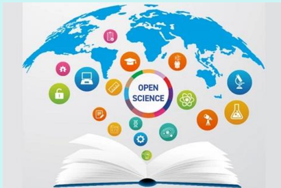
Towards a FAIRer World Implementing the UNESCO Recommendation on Open Science to address global challenges | UNESCO, International Science Council (ISC), Committee on Data (CODATA) and World Data System (WDS) | UNESCO, Paris & Virtual | March 29, 2023 | 9:00 am to 6:00 pm (CEST)