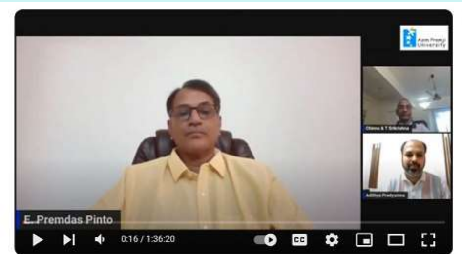
Let's Talk Public Health: Making Medicines Accessible to All

15th Annual Sue MacRae Lecture – JCB Seminar Series 2023-24 : Sexual and Gender Diversity in Cancer Care – The PMChosenFamily Program | University of Toronto Joint Centre for Bioethics | Thu, Mar 14, 2024 1:30 AM – 3:00 AM GMT+5:30